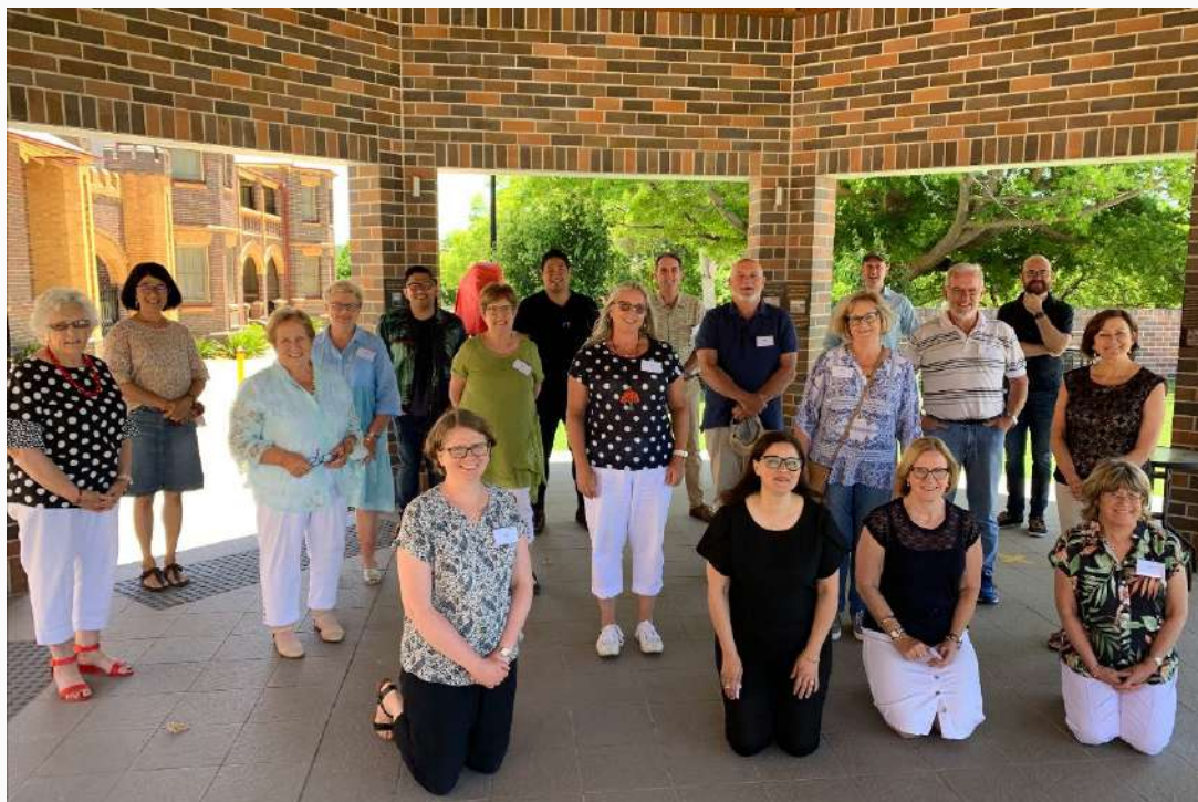
CCRESS representatives from our NSW-ACT Catholic Dioceses gathered in Armidale.

For more information on CCRESS, see: https://www.ccress.org.au/