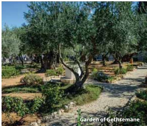
Garden of Gethsemane