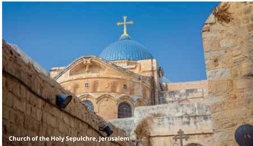
Church of the Holy Sepulchre, Jerusalem